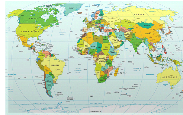
Map of the world

During Music , the children will work on short rhythmic patterns and alternating two different sounds using a variety of instruments.